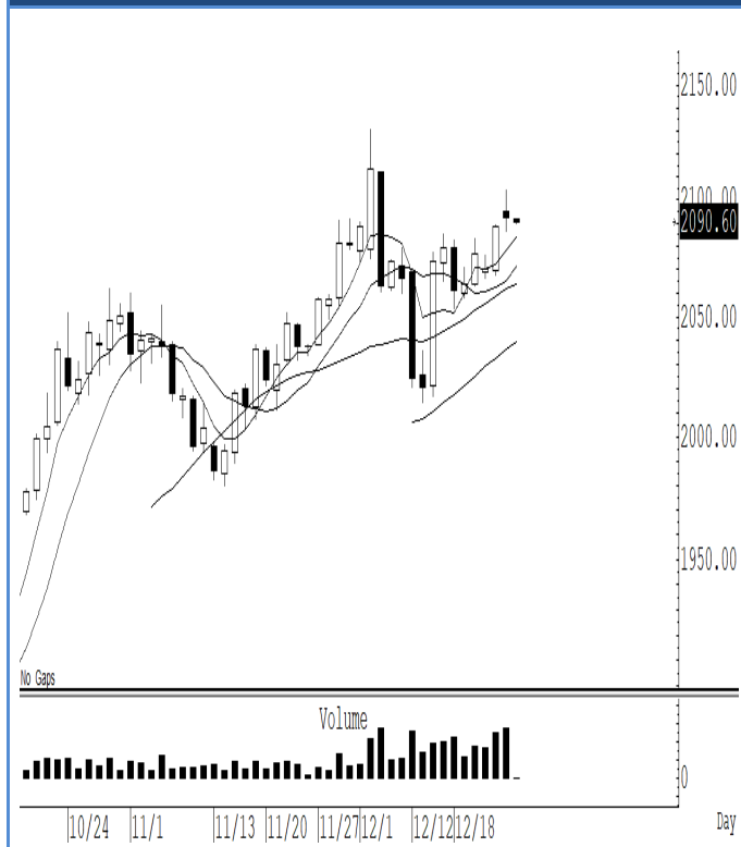
GOH24 (Close 2,090.60 Chg -1.90)

ราคาทองคำโลกแกว่งออกด้านข้าง เราแนะนำยกการ์ดสูงหรือตั้ง stop ไว้ เนื่องจากทิศทางยังไม่แน่นอนจนกว่าจะกลับขึ้นไปปิดเหนือระดับ 2,110 ดอลลาร์ แนะนำ trading ในกรอบ 2,080-2,110 ดอลลาร์ ระวังกำไร แต่ถ้าในกรณีที่ปิดต่ำกว่าระดับ 2,060 ดอลลาร์ แนะนำถือ short หวังผลปรับตัวลงไปแถว ๆ 1,980 ดอลลาร์ ระวังกำไร